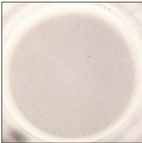
Stimulus: none ( 5 \times 10^4 cells/well)